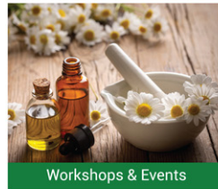
Workshops & Events