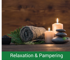
Relaxation & Pampering