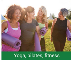
Yoga, pilates, fitness